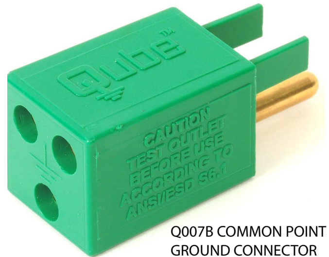
Q007B COMMON POINT GROUND CONNECTOR

The Prostat Qube™ replaces ordinary electrical grounding devices with a convenient, cost effective means to connect several ESD controls to a single grounded electrical outlet. Use the Qube™ to ground workstations, mats, wrist strap & testers, instruments, and other ESD control products to a pre-tested facility electrical ground. It consists of a robust multi receptacle frame encased in fire retardant ABS with a solid brass grounding pin.