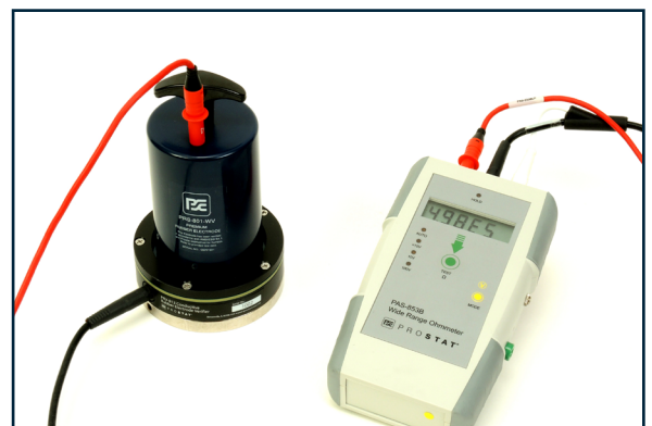
Optional: PAS-853B Wide Range Ohmmeter