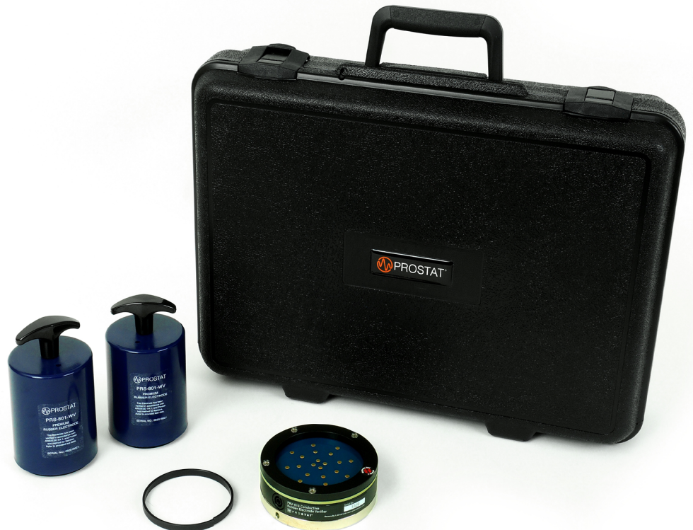
PRV-815 Premium Electrode Qualification Kit

A light dressing pad is provided to allow dressing Premium Electrode when needed.